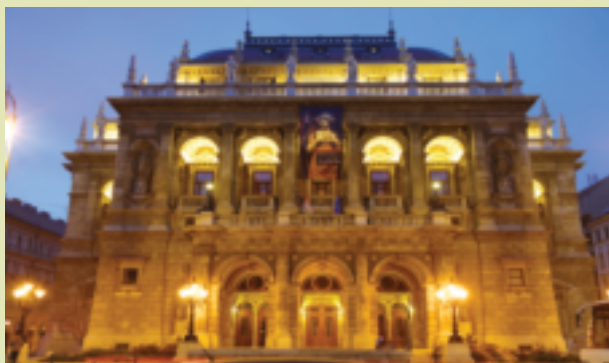
Budapest Opera House