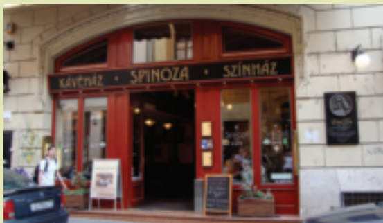
Spinoza café, theater, and restaurant in the old Jewish Quarter

Follow in the footsteps of more than 2,500 undergraduates who have taken advantage of Budapest Semesters in Mathematics (BSM), the preeminent study abroad program in mathematics. Founded in 1985 by friends of Paul Erdős, the program encourages student creativity, a key element in the highly successful Hungarian method of mathematics instruction.