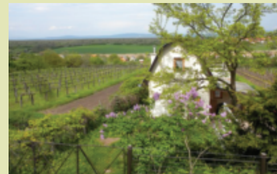
Rural landscape on a countryside bike ride