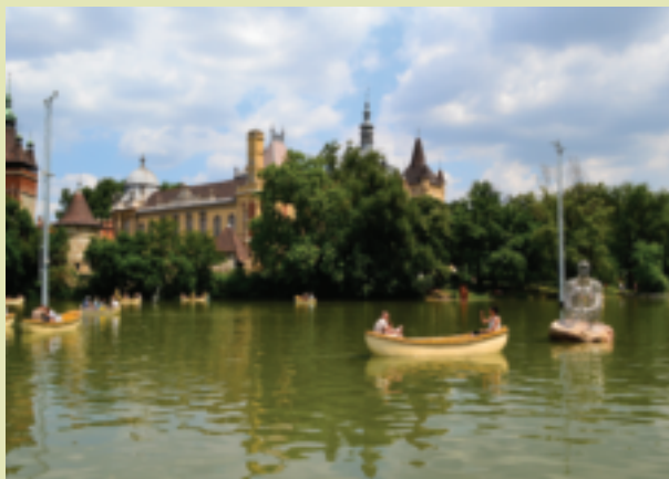
Budapest's City Park

Hungary is a small country, about the size of Indiana. A member of the European Union, Hungary developed its distinctive culture over a thousand-year history, blending influences from East and West. Budapest, the capital, a city of two million, displays a scenic combination of natural and architectural beauty on the banks of the Duna (Danube) River. Famous for its graceful bridges, green parks, vibrant culture, and delicious food, Budapest is a remarkably safe and pleasant place.